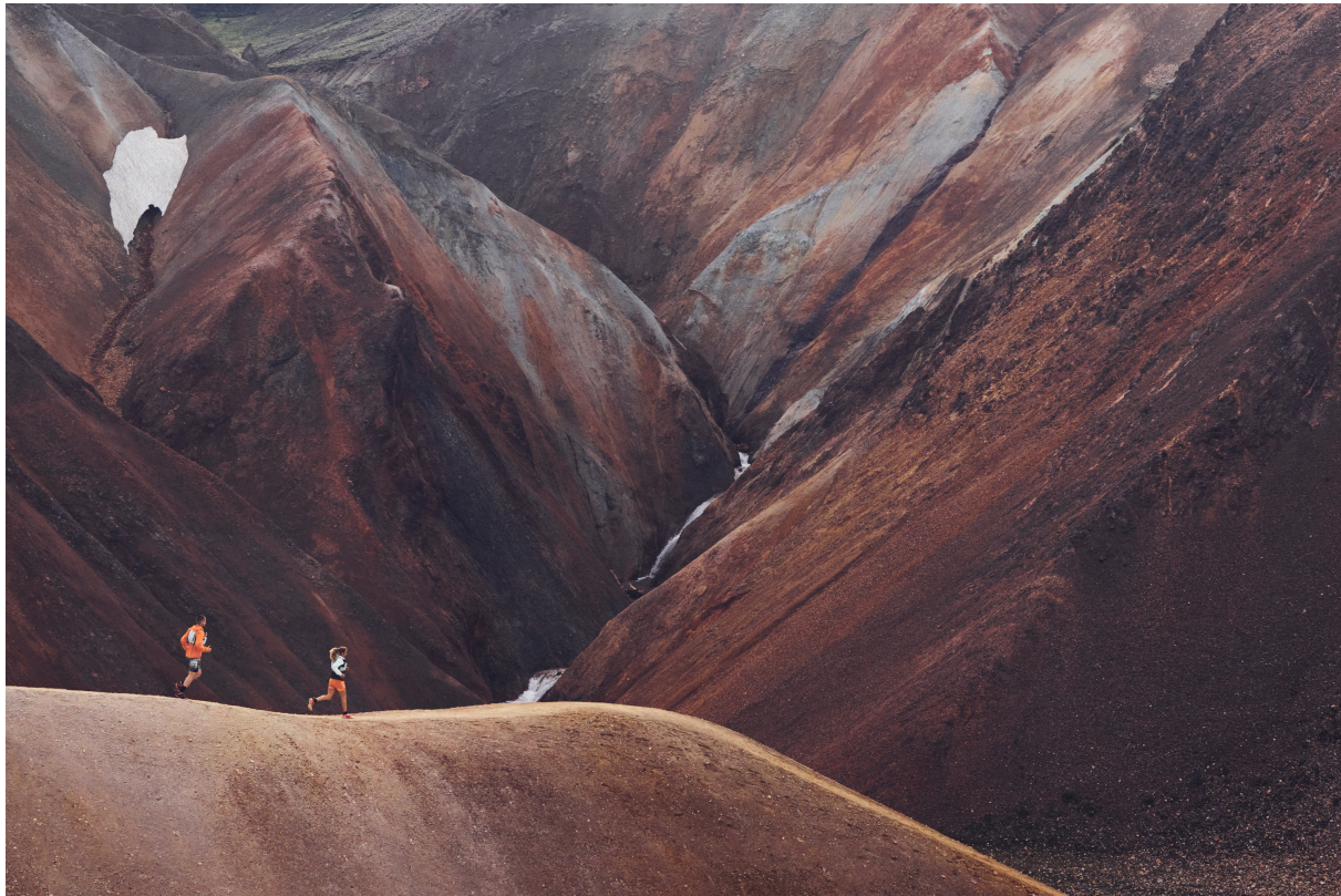
Trail running in Iceland in the 100 % decarbonized Trail Running collection

By signing a carbon dioxide removal (CDR) agreement with Climeworks on January 2, 2023 to remove a portion of its CO 2 emissions directly from the atmosphere using direct air capture technology, Mammut is taking a significant step towards reaching its goal of being net zero by 2050. Mammut is the first company from the outdoor sector to conclude an agreement with Climeworks, making the Swiss company a pioneer and positioning it on the front line in the fight against climate change.